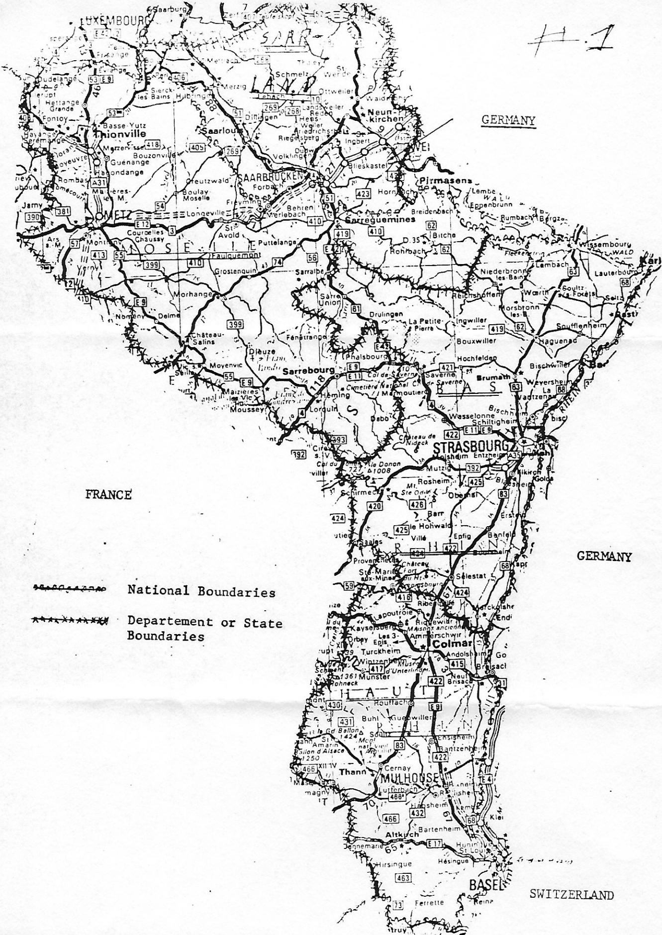
The Atlantic Bridge to Germany