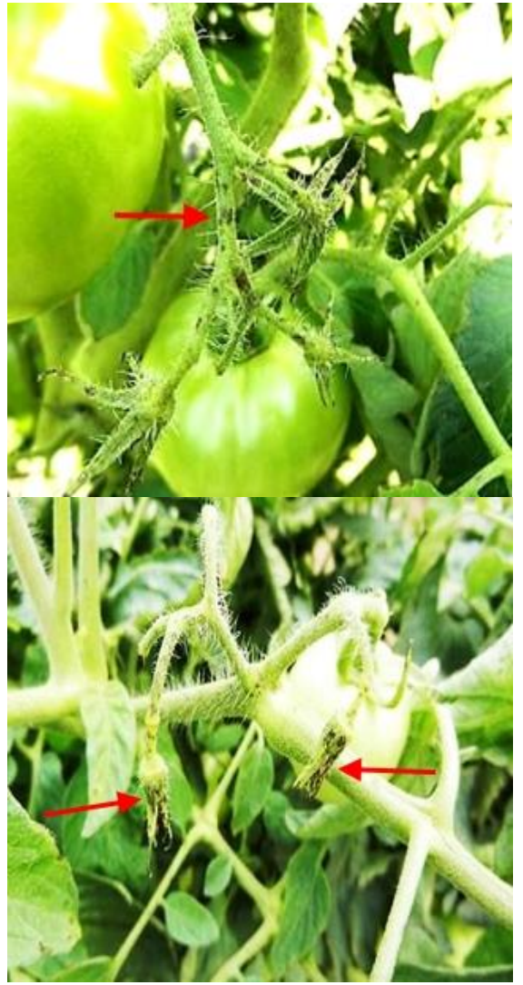
Figure 2. Bacterial spot on tomato pedicels and flowers, which will cause blossom drop