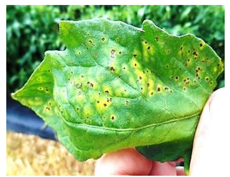
Figure 1. Bacterial spot on a tomato leaflet