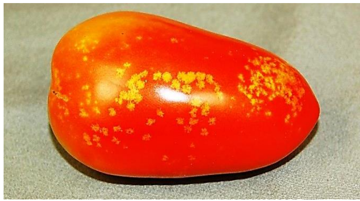
Figure 2. Feeding damage by stink bug nymphs causing star-burst patterns