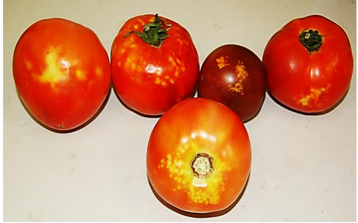
Figure 1. Stink bug feeding damage to tomatoes

under the skin of green tomato or pepper fruit and as yellow sunken areas in red fruit. Peel away this outer skin and a spongy white area is found underneath (Fig. 3). This damage usually makes the fruit unmarketable. If you search for the pests you often have a hard time finding them as they will become frozen and drop from the plant onto the ground at the first sign of disturbance. The adults can be seen at times in the early morning feeding, but as the day becomes hotter they tend to move into the center of the plant. Stink bugs also feed extensively at night, which is another reason they are difficult to scout for. At times the nymphs can be found in the interior of the tomato or pepper plant where they feed on foliage and fruit. Often the only thing that alerts you to their presence is the damaged fruit, and by then it is too late. Normally we see a small amount of damage to the fruit along the field edges, especially if these edges border woods. But for the last two years we have seen much more extensive feeding damage throughout tomato and, to a lesser extent, pepper fields.