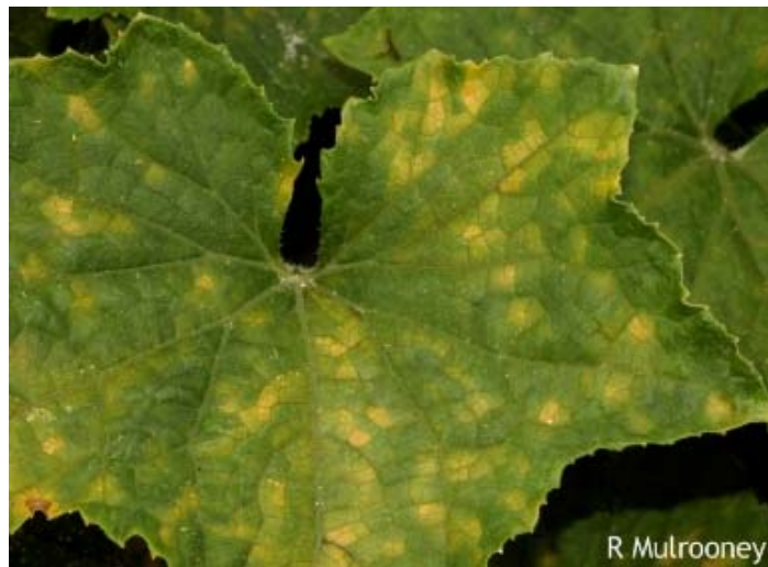
Downy mildew caused by Pseudoperonospora cubensis on the upper leaf surface

For other cucurbit crops we are suggesting that you wait until the disease is seen on crops other than cucumbers. Be sure to be checking your fields daily especially in areas that had heavy rainfall Sunday. Our sentinel plots have other cucurbits including cantaloupe, pumpkin, watermelon and winter squash. To repeat, downy mildew was only seen on cucumber near Georgetown, DE and it is not present on any crop in the sentinel plots in Salisbury, MD. To track disease development visit the Downy Mildew Forecast website often http://www.ces.ncsu.edu/depts/pp/cucurbit/