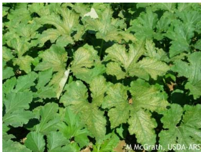
Ozone injury on pumpkins