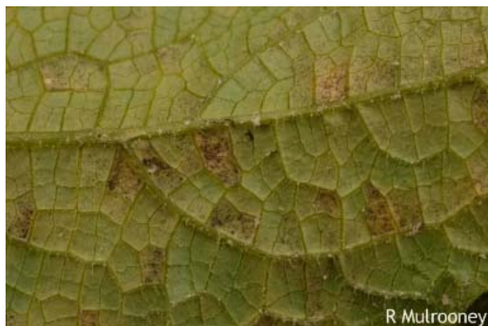
Downy mildew infection on the corresponding lower leaf surface - purple fuzzy growth is the fungus sporulating from the infected leaf tissue.