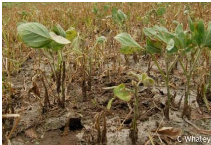
Stunted and dying plants infested with SCN