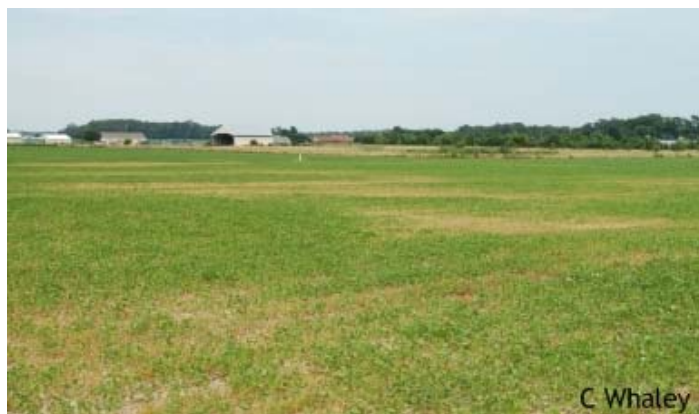
SCN damage often shows up as random spots in the field.

The first soybean cyst nematode sample came into the lab this week. Plants were stunted and in some patches dying. White and yellow females were very evident on the infested roots. High initial egg populations in the soil and droughty conditions soon after planting can result in these symptoms. Other problems can look like SCN. The only way to be sure is to look at the roots or take a soil sample that includes some plants as well.