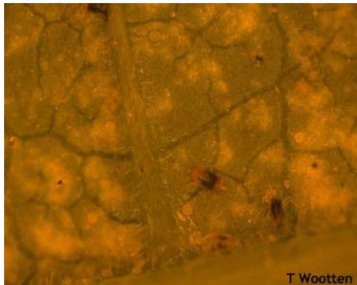
Two spotted spider mite adults and eggs

In late July through August, pole lima beans often start to yellow because they are running out of nitrogen. Even though lima beans are legumes, we grow them using nitrogen fertilizers because they tend not to produce enough nitrogen with the nitrogen fixing bacteria. An August side-dressing of nitrogen fertilizer will often be necessary to keep these vigorous vining plants growing and setting pods.