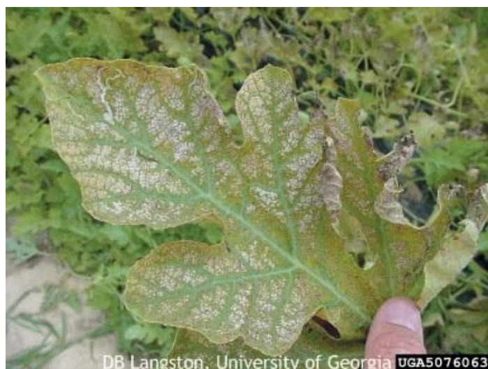
Ozone injury on watermelon

The key to avoiding air pollution injury is to plant varieties that are of low susceptibility and to limit plant stresses. Certain fungicides such as thiophanate methyl (Topsin and others) offer some protection against ozone damage. Antioxidants such as ascorbic acid and EDU (ethylene diurea) have been tested as protectants against ozone damage and some have shown promise.