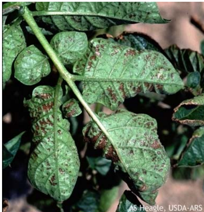
Ozone injury on potato

Injury on watermelon leaves consists of premature chlorosis (yellowing) on older leaves. Leaves subsequently develop brown or black spots with white patches. In muskmelons and other melons, the upper surface of leaves goes directly from yellow to a bleached white appearance. Watermelons are generally more susceptible than muskmelons to ozone damage and damage is more prevalent when fruits are maturing or when plants are under stress. Injury is seen on crown leaves first and then progresses outward. There are great differences in variety susceptibility with some older varieties such as Sugar Baby and Crimson Sweet watermelon and Superstar muskmelon being very susceptible. Seedless watermelon varieties tend to be more resistant to air pollution injury than seeded varieties, so injury often shows up on the pollenizer plants first. Ozone damage ratings were done on 60 diploid (seeded) and triploid (seedless) watermelon cultivars at North Carolina State University in 2000-2001. A large number of these varieties are still being used here on Delmarva. Pictures and ozone damage ratings from this research can be found at http://apsjournals.apsnet.org/doi/pdf/10.1094/PDIS.2003.87.4.428 . Injury on squash and pumpkins is intermediate between watermelon and cantaloupe starting with yellowing of older