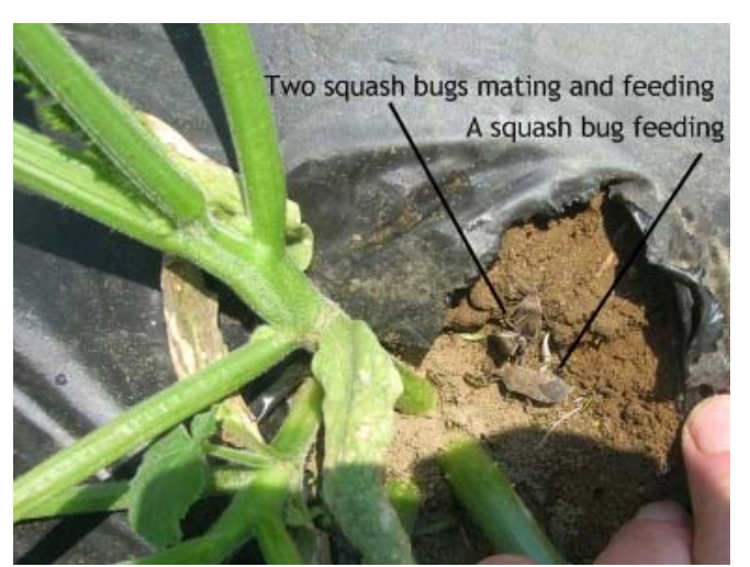
Figure 3. Squash bugs at the base of wilted pumpkin plant under plastic mulch