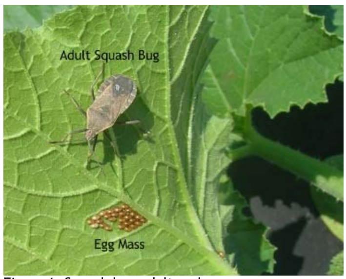
Figure 1. Squash bug adult and egg mass

Many of the pumpkin fields in the Delmarva area I have visited in the last two weeks were just coming up or had 2-5 leaves on them. I was surprised to see several squash bugs on these small plants. I also found many egg masses (Fig. 1) on the underside of leaves, usually in the crotch of two veins. In some fields with plastic the squash bugs were feeding below the plastic mulch causing the plants to wilt (Figs. 2 and 3) and eventually die. Normally there are only a few fields that will have squash bugs this early. but just about all of the fields I looked at had enough squash bugs to justify treatment. Growers need to watch for squash bugs on their early pumpkin plants, especially down in the plastic hole. A spray may be needed if the plants are stressed (like they were last week from the intense heat) and there are 2 bugs or 1 egg mass per plant.