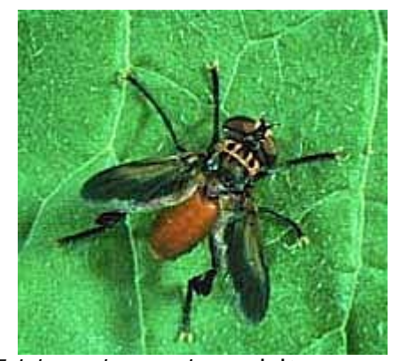
Fig. 4 Trichopoda pennipes adult