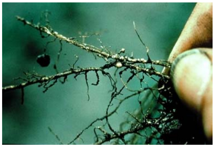
Small white female SCN and a large nitrogen fixing nodule for comparison. (SON)

being planted after barley and wheat it still is not too late to soil test for SCN, especially if you are not planting a resistant variety.