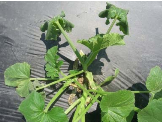
Figure 2. One pumpkin plant (top) wilting due to squash bug feeding

moderate to low infestation levels of squash bugs, these parasitoids will not keep a large population of squash bugs below thresholds.