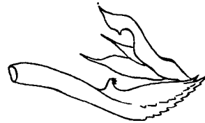
FIG. 3. Kamendaka tayabasensis sp. nov., aedeagus.