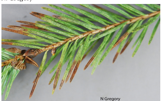
Adult bagworm