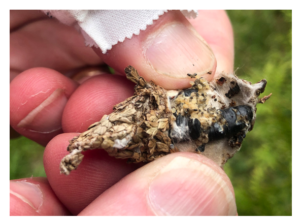
Bagworm hatching from eggs in bag.