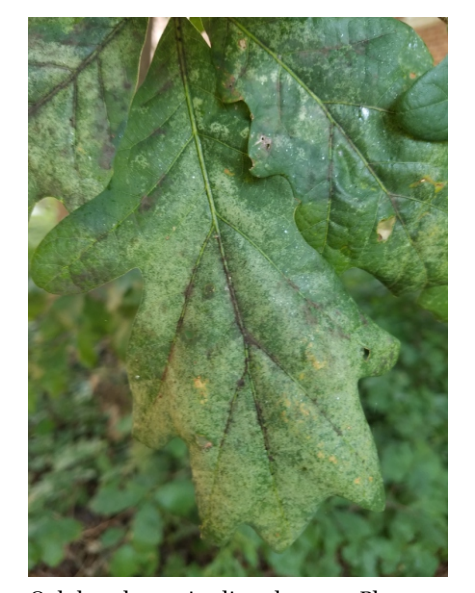
Oak lace bug stippling damage.