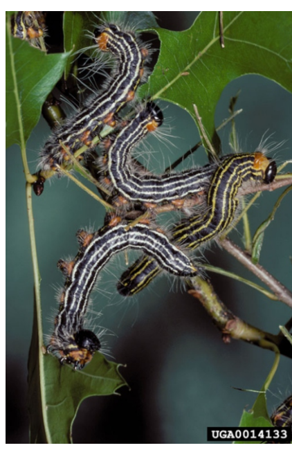
Yellownecked caterpillar on oak.