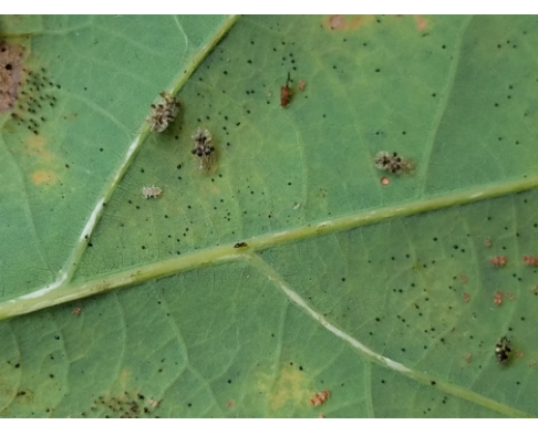
Oak lace bug.