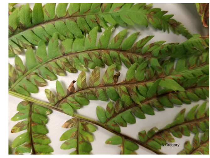
Foliar nematode symptoms on cinnamon fern.

parasite nematodes. The stylet is inserted into plant cells and enzymes pass into cells where components are digested, and nutrients drawn back into nematodes. Free water on stems and leaves provides an environment for nematode infection, with splashing water moving nematodes from leaf to leaf and plant to plant. Plants with symptoms occur in patches because of water splash between plants. Optimum temperatures for foliar nematode development are between 21 and 24C (70-75F), and reproduction is by means of eggs which hatch to release larvae. Management of foliar nematode is mostly cultural because chemicals do not penetrate leaves to reach nematodes. Use clean planting material, discard infected plants, avoid overhead water on leaves, and maintain good spacing between plants. Mix species of plantings to avoid monoculture of species affected by foliar nematode.