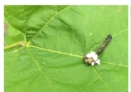
Parasitized catalpa worm.