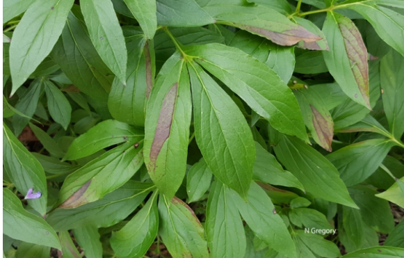
Foliar nematode symptoms on peony.