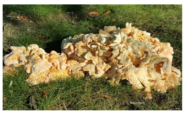
Chicken of the woods.

FUNGAL BRACTS ON TREES such as Laetiporus sulphureus , the chicken of the woods, are appearing. Laetiporus, the sulfur shelf fungus, is a choice edible, most often at the base of trees near the ground, sometimes they are brackets higher on trunks of trees. These fungi usually enter through a wound, and cause heart rot, a very slow decline and the tree may live on for years. Rotting of interior wood can lead to breakage and invasion by insect pests. Reduce stress on trees and prune to remove dead wood. High moisture this year has brought out fruiting bodies earlier than the norm. As always, I recommend not eating anything that you do not have identified in person by an expert.