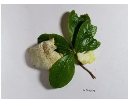
Exobasidium leaf blight on camellia.