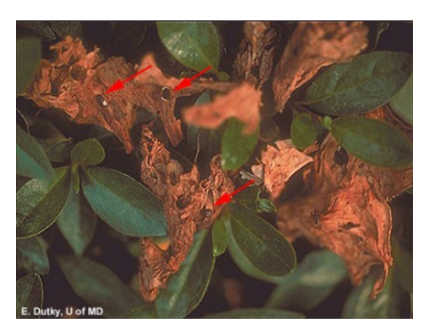
Ovulinia petal blight on azalea.

Swarthmore College (Delaware County, PA) = 279 ('18 = 116) Fischer Greenhouse (New Castle County) = 296 ('18 = 116) Research & Educ. Center, Georgetown (Sussex County) = 341 ('18 = 162) (Sussex County) = 341 ('18 = 162)