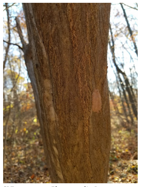
SLF egg mass.