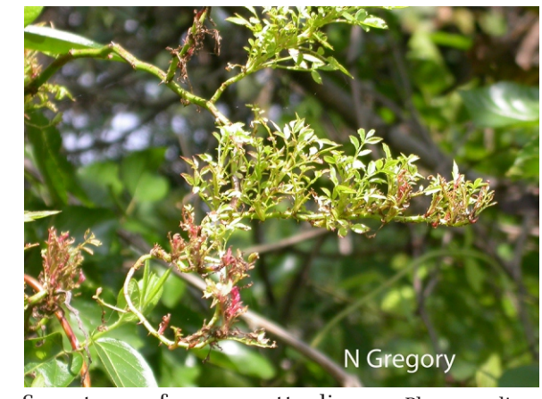
Symptoms of rose rosette disease.

SYCAMORE ANTHRACNOSE is beginning to show up on trees after the rain last Sunday. Anthracnose, caused by host specific fungi, occurs every year on various hardwoods, and survives in buds and twigs. Infection and spread is favored by wet and windy weather, and symptoms include dark blighted leaf tissue. Affected leaves drop, but the trees usually put of new growth and the long term health of the tree is not affected.