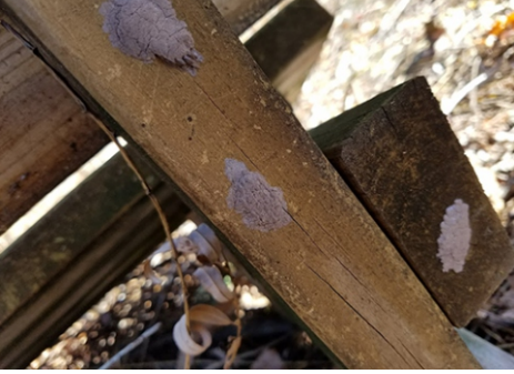
Spotted lanternfly eggs.