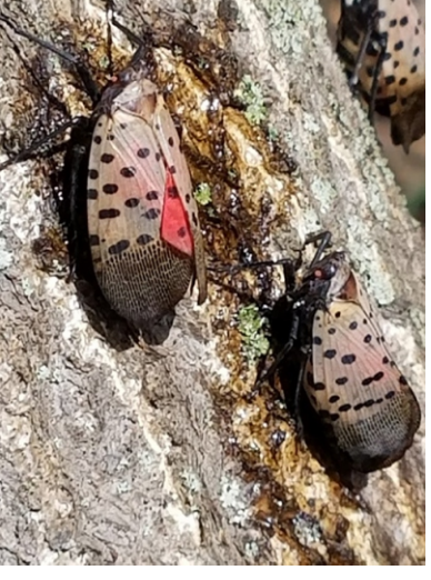
SLF adult and weep wound.