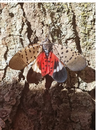
Spotted lanternfly adult.