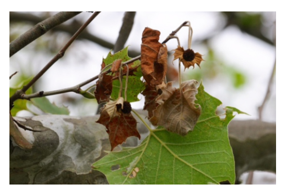
Symptoms of sycamore anthracnose.