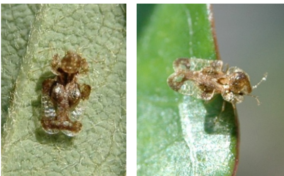
Lace bug close ups.