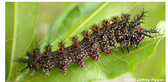
Buck moth caterpillar.

Doug Tallamy is looking for buck moth caterpillars. If you find any please either CONTACT (bakunkel@udel.edu) OR (dtallamy@udel.edu).