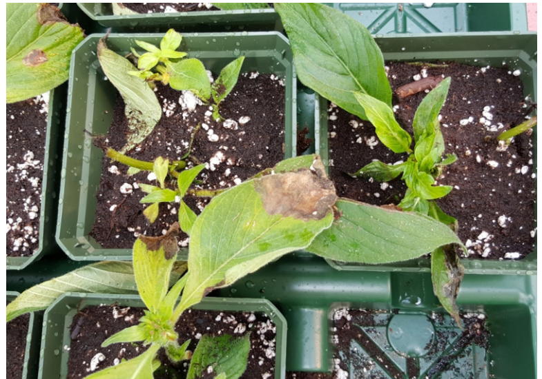
Botrytis on greenhouse cuttings.