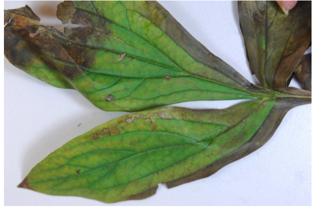
Foliar nematode on peony.

BOTRYTIS BLIGHT is everywhere--on fading flowers, new buds, frost damaged tips, and on greenhouse bedding plants and vegetables. Botrytis is a common fungus with a very wide host range, favored by damp and cloudy conditions. Trim off frost damaged foliage and blooms to avoid the Botrytis fungus becoming established in the twigs. Discard rather than compost. Tulip fire is a disease that looks like a scorch, which is caused by the fungus Botrytis. Strawberry plants are very susceptible to Botrytis blight. Sanitation is key to control.