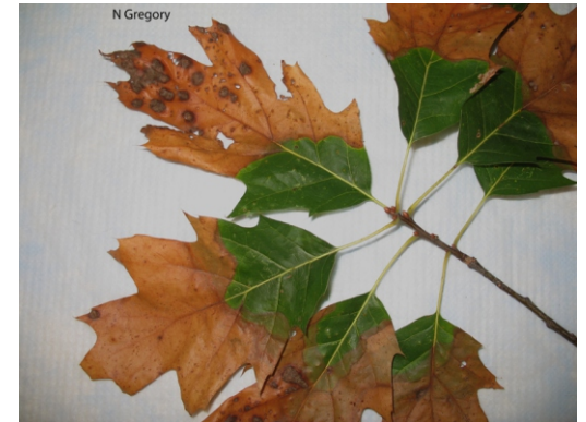
Bacterial Leaf Scorch on Red Oak.

http://ir4.rutgers.edu/Ornamental/Survey/index.cfm?utm_source=Ornamental+Horticulture+Grower+%26+Extension+Survey&utm_campaign=grower+survey&utm_medium=email