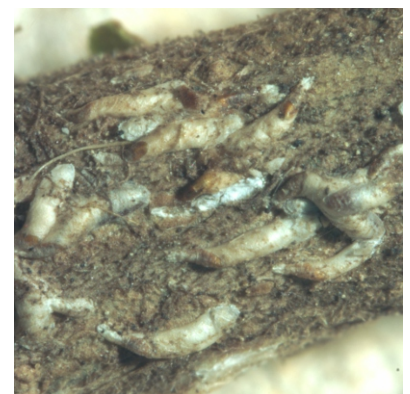
Japanese maple scale.