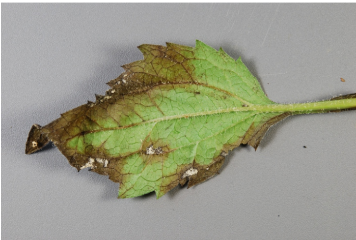
Downy mildew on Rudbeckia lower leaf surface.