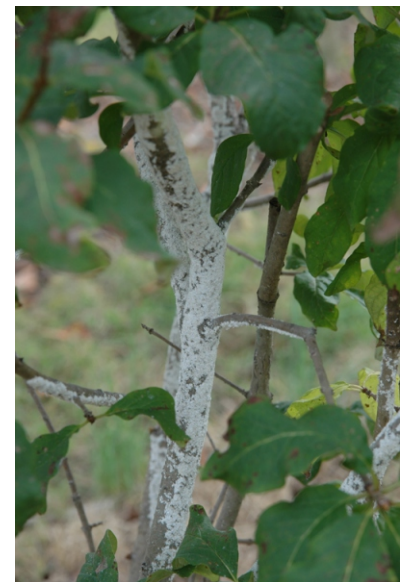
White prunicola scale.