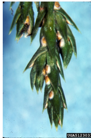
Juniper scale adults