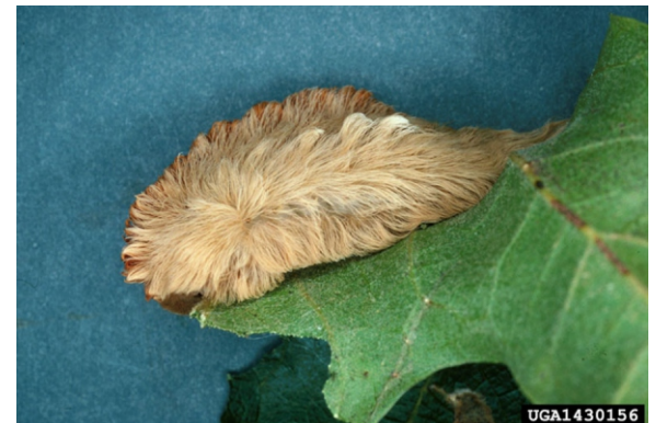
Puss caterpillar.