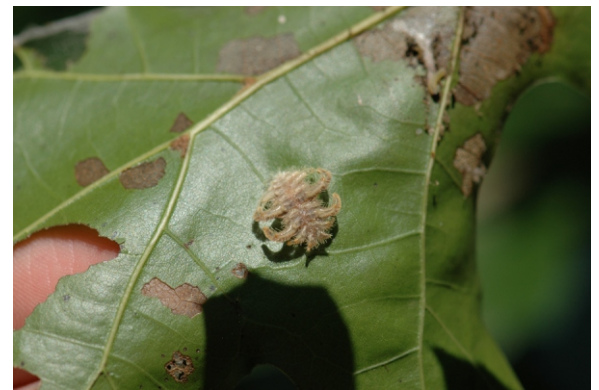
Monkey slug caterpillar.