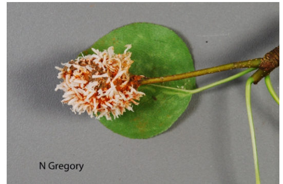
Gymnosporangium on fruit of callery pear.