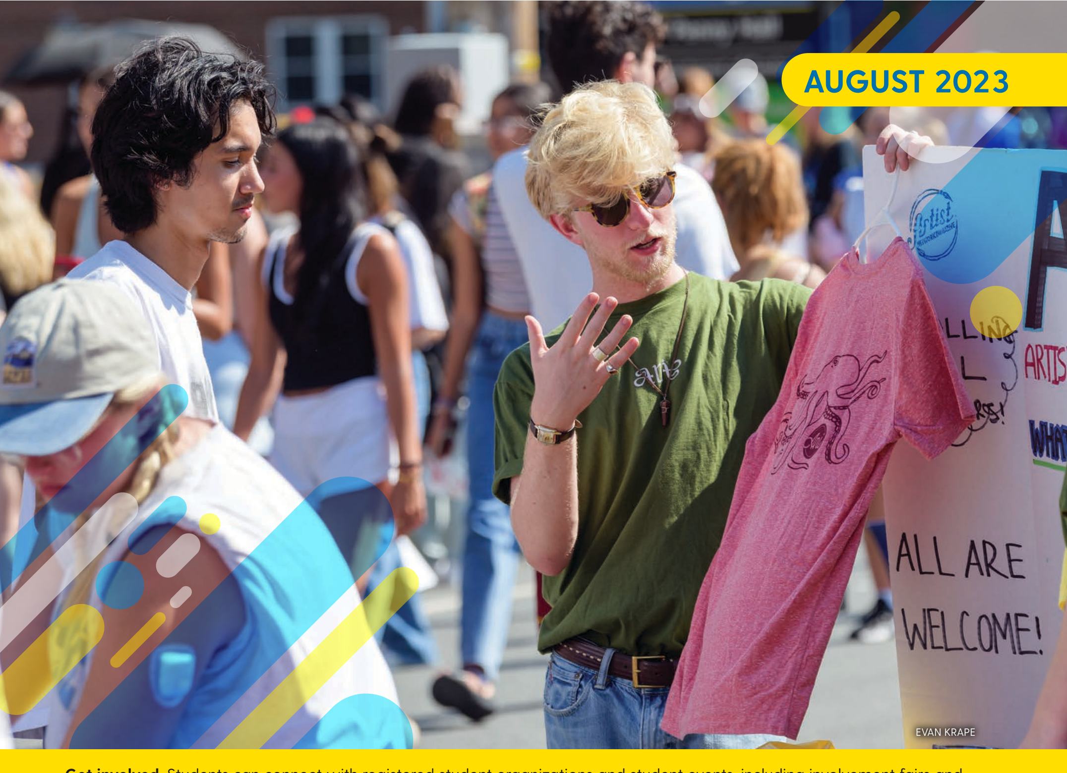
Get involved. Students can connect with registered student organizations and student events, including involvement fairs and meetups, on the Student Central portal: studentcentral.udel.edu