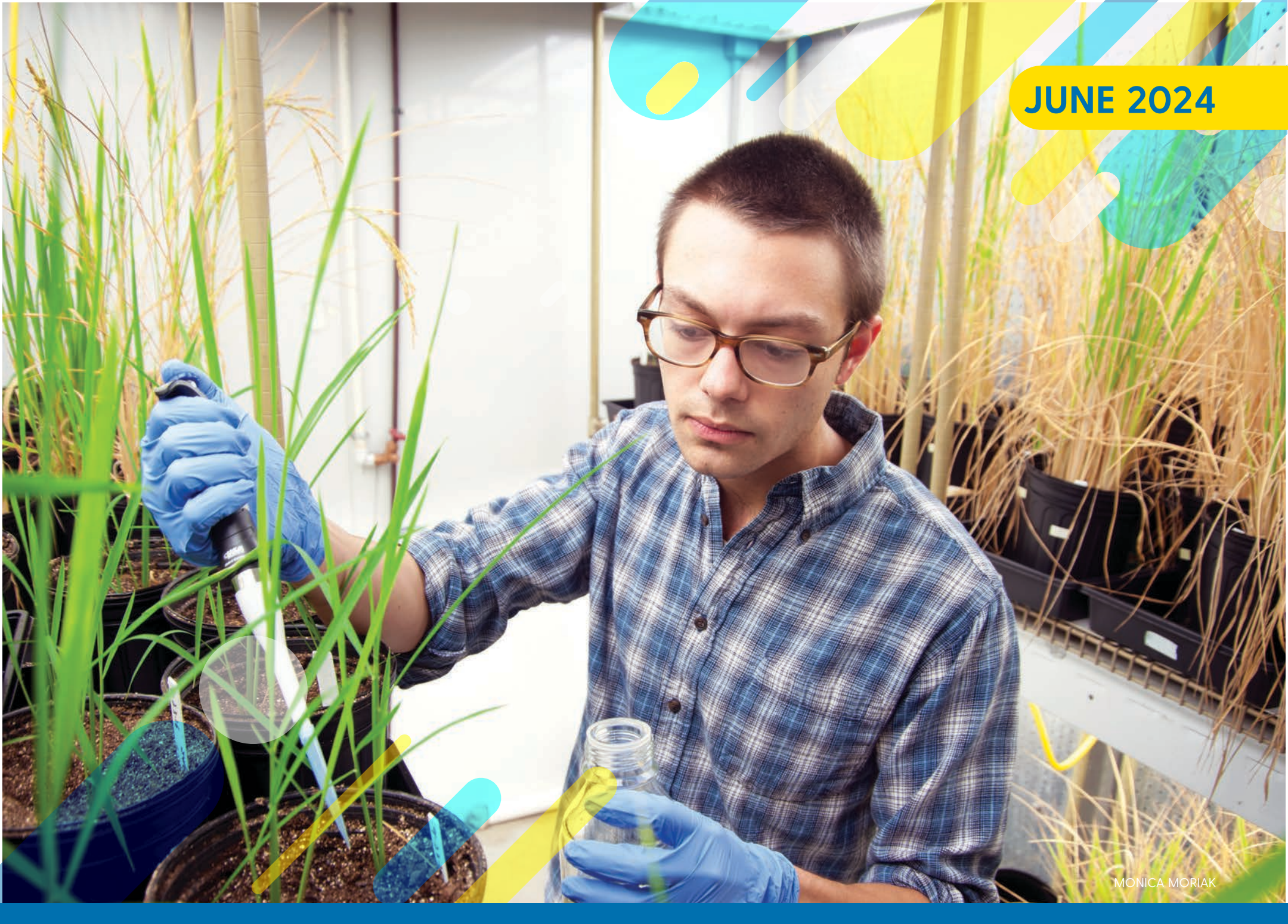
True to UD's agricultural roots, the learning never stops and the summer months are often most rewarding as students dig in deep for the fruits of their labor on the farm, on the coast or even from the comfort of their own homes.