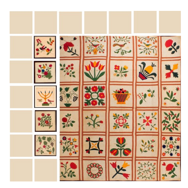
Fig. 6. Diagram of the quilted Harrison Album Quilt, the 5 individual unquilted blocks, and the missing 14 blocks that likely belonged in this quilt group but were separated by H.F. du Pont in 1925

While women did organize around a myriad of social reform issues, antebellum sewing circles in particular served as popular social quilting spaces in album quilts' peak, providing an important space for political ideas to develop and supplying philanthropic causes with fundraising opportunities.<sup>21</sup> Organized by spatial proximity or around reform movements, sewing circles produced quilts to be sold for fundraisers or anti-slavery bazaars.<sup>22</sup> They were productive: in some cases these circles completed and sold quilts within a day.<sup>23</sup> Perhaps because these areas added the weight of women's political voices to reform politics, they were more commonly ridiculed. Ames' Series of Standard and Modern Drama no. 138 published "A Sewing Circle of the Period: an Original Farce in One Act" in 1884, which satirized female community within a neighborhood's sewing circle. Listing the setting as "Anywhere-And Perhaps Everywhere," lampooned a community of women as nothing more than gossiping, competitive, two-faced neighbors.24