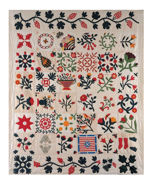
Fig. 4. Cross River Album Quilt. 1861. American Folk Art Museum, accession no. 1980.8.1.

The signature quilt craze burned brightest in the United States between 1840-1860, snuffing out on the eve of the American Civil War. Thought to have been inspired by a common early nineteenth-century practice of collecting signatures in small album booklets, signature quilts, also referred to as friendship or album quilts depending on the nature of its inscriptions and block patterns, were a collaborative quilting activity with multiple makers.<sup>5</sup> Regional distinctions in their patterns, materials, and usage formed within this 20-year period. For example: a chintz appliqued album quilt made in Baltimore has more differences than similarities with a red and green applique New York album quilt (Fig. 3). The Harrison Album Quilt reflects a popular red and green applique album quilt tradition that was common in the upper Mid-Atlantic and New England regions, but with distinctive block patterns most congruent with the 1861 Cross River Album Quilt, also made in Westchester County lines (Fig. 4).6 Applique techniques in particular demonstrate the sewer's skill in manipulating curved fabric edges into flat motifs as they tuck the raw edges under and sew them down with invisible or decorative stitches.7 When the Civil War began in April 1861, the women behind album quilts turned their needles to war-related sewing activities, effectively halting album quilts' popularity.8