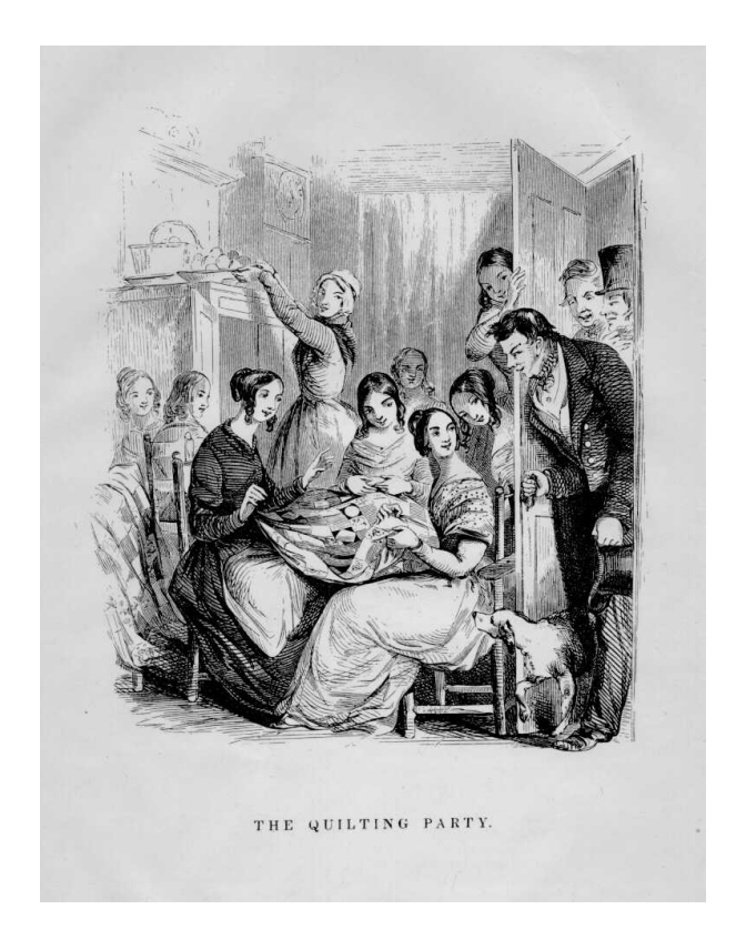
Fig. 5. Artist Unknown. The Quilting Party . Wood engraving. 1849. From Godey's Lady's Magazine.

Apart from a quilt's function as bedding, an album quilt had several performative aspects.<sup>13</sup> At its most economical it displayed the makers' means, skill, and in some instances eligibility for matrimony; at its most romantic it reminded the owner of friendships that would endure regardless of distance or life's circumstances. Both instances were worth showing off. The making of an album quilt was considered a public-facing activity even inside the home, as seen in a September 1850 issue of the widely-circulating Godey's Lady's Book, when a daughter and mother of the fictional short story, "Mrs. Eookly's Question Party," featured "showing your album quilt" in a list of possible party activities.<sup>14</sup>