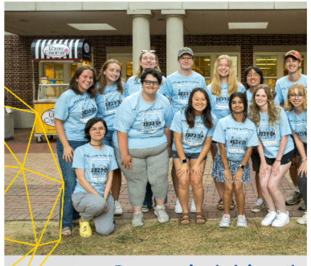
Do you enjoy helping othe