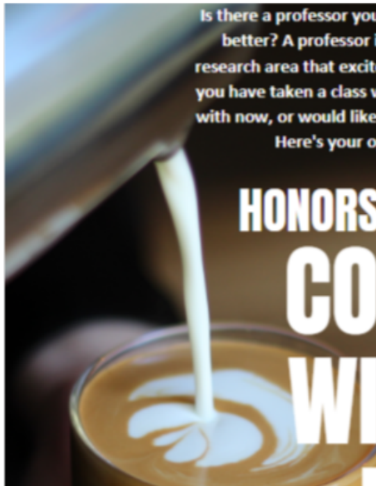
Coffee with a Professor