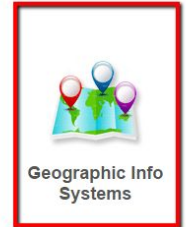
Geographic Info Systems