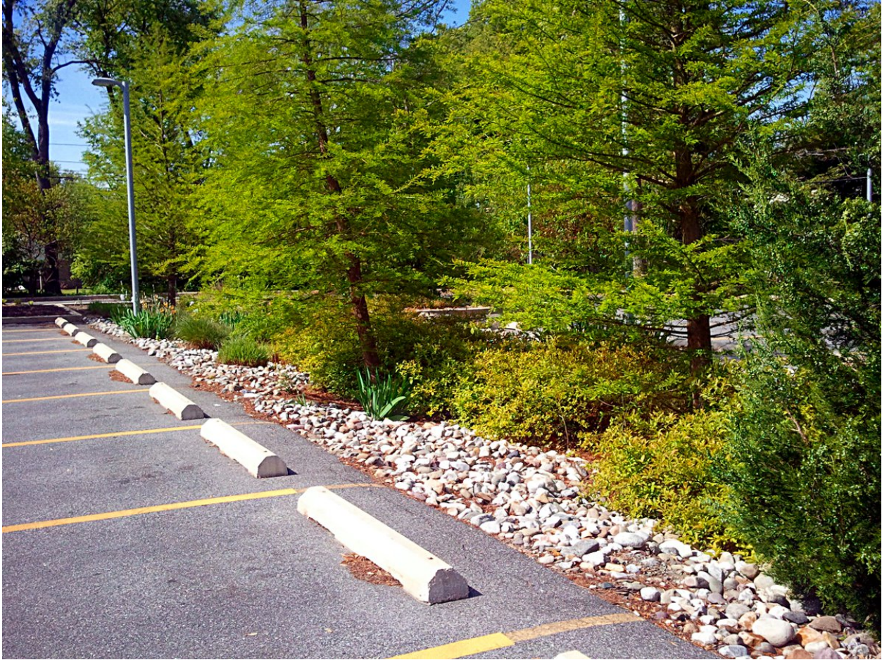
FIGURE 1: Bioretention Basin, University of Delaware

Urban vegetative cover physically removes air pollutants and CO 2 , and indirectly reduces the CO 2 emissions that urban areas create. Air pollution mitigation is accomplished in an urban forest canopy through a dry deposition process which removes air pollutants such as SO 2 , NO x , CO, and particulate matter, and moves the pollutants into the plant tissue or washes them off the leaf surface by rainfall (Jim and Chen, 2008). Urban vegetation within the City of Los Angeles is responsible for the removal of 4,476 tons of air pollutants a year (Nowak et al, 2011). Urban forest management has been found to be moderately effective in offsetting annual CO 2 emissions in Miami-Dade County and Gainesville, Florida, with trees sequestering 1.8 percent (3.6 tons/hectare/year) and 3.4 percent (5.8 tons/hectare/year) of annual citywide carbon emissions (Escobedo et al, 2010). The effectiveness of air pollutant removal by urban forests varies by the composition of tree species, leaf surface area, principle time of growth, and local pollutant concentrations (Escobedo and Nowak, 2009; Mitchell et al, 2010).