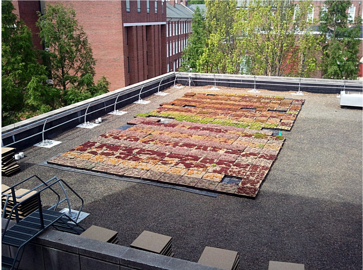
FIGURE 2: Green Roof, Colburn Hall, University of Delaware

note that urban forests can also be responsible for emissions in the form of pollutants emitted through urban tree maintenance activities or biogenic volatile organic compounds released directly from some species of trees (Jim and Chen, 2008; Dobbs et al, 2011). On average, however, green infrastructure offers a net reduction in atmospheric CO 2 .