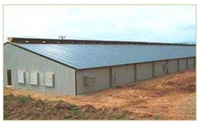
Figure 2. Typical Modern Poultry House

Depicted below is a typical modern poultry house of steel construction. Note several fan installations on the side wall used for cooling and ventilation. Note also the considerable exposed roof area, suitable for PV installation.