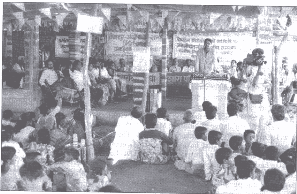
A local campaign meeting to stop Enron's Dabhol power plant.

Powers's entire testimony was riddled with an underlying contempt for developing countries in general and India in particular. She described all developing countries, including India, as places where "the lights don't stay on, the water isn't safe to drink, the roads are dangerous and congested, and 'phone calls are impossible to make or receive". 28 Her (not so) implicit conclusion was that multinationals will civilize these countries through their